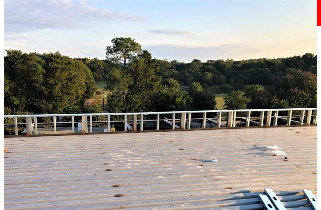
Metal Framing Complete at High Roof of The New Addition