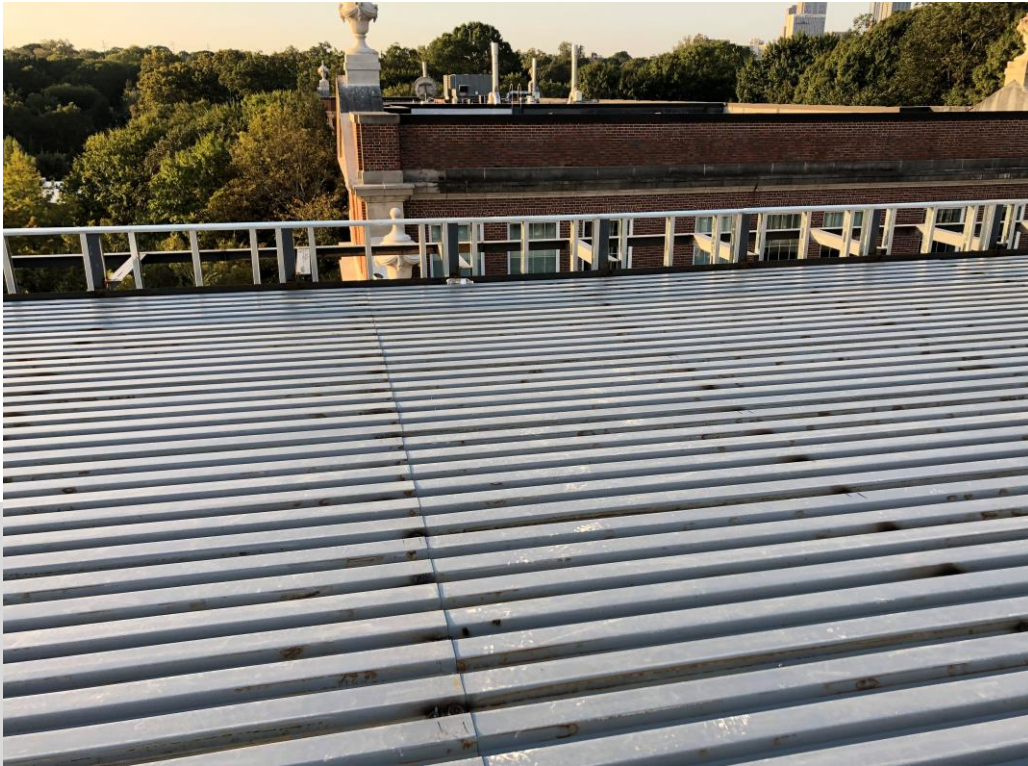
Metal Framing Complete at High Roof of The New Addition