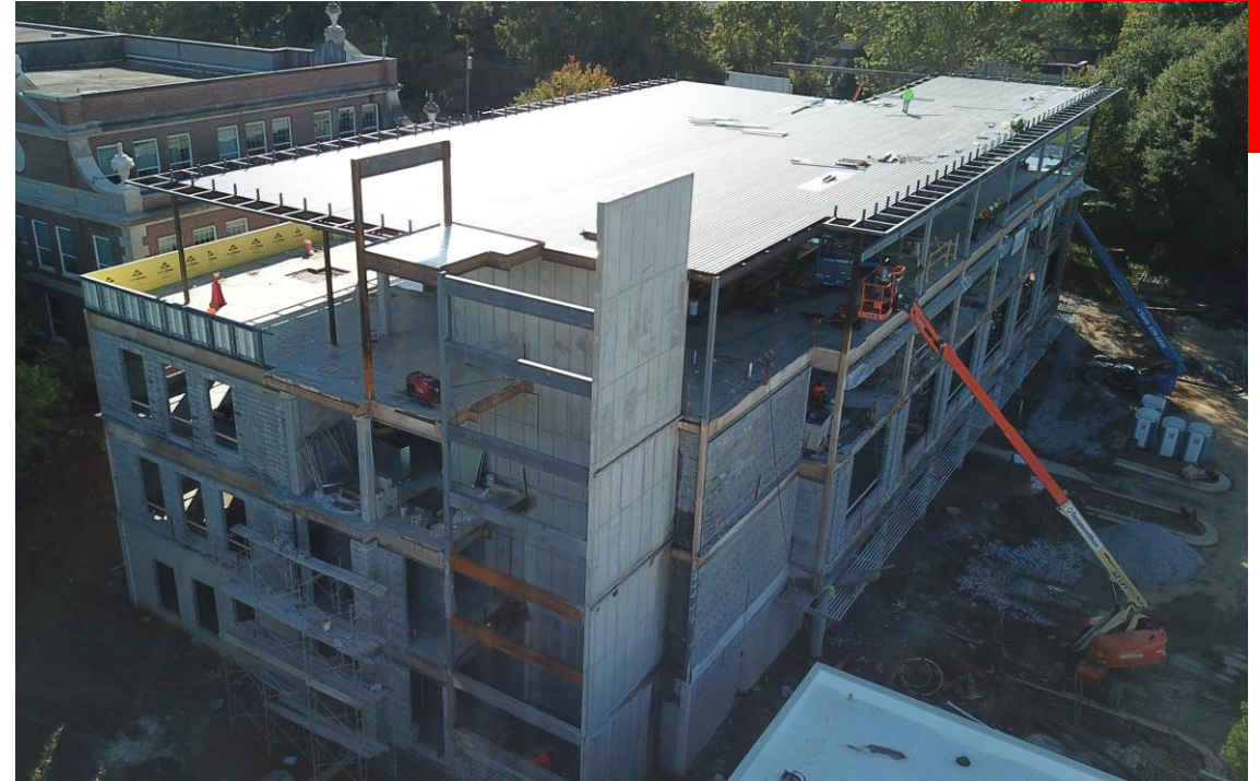
New Addition Progress