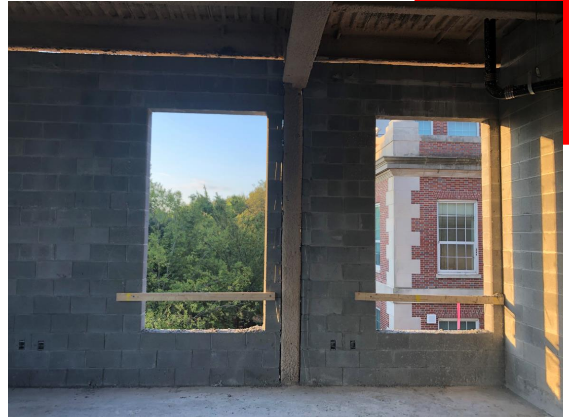
Walls installed at South East Exterior