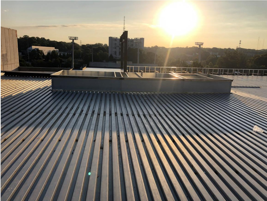
Rooftop Curbs set on High Roof of New Addition