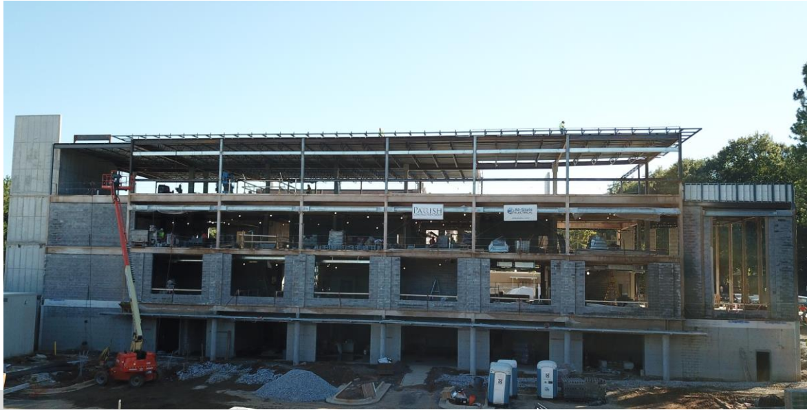
New Addition Progress